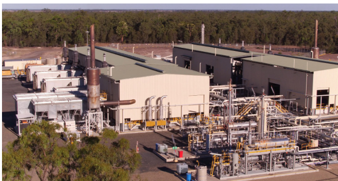
Daandine Power Station