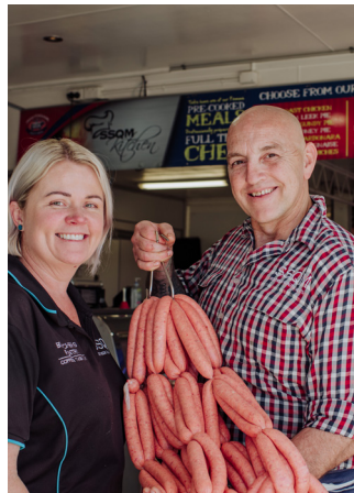
Dalby Southside Butcher