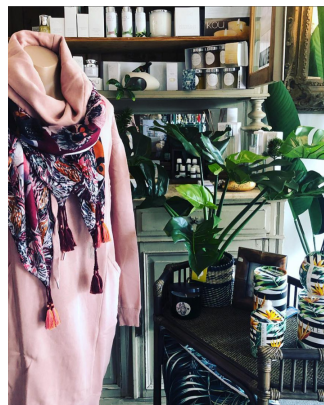
Bella & Spice in Dalby