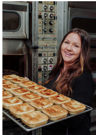
Mace's Hot Bread in Miles