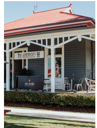
Urban Paddock in Dalby