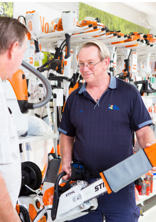
Dalby Mower Supplies