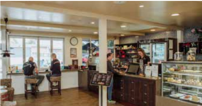
Chinchilla Downtown Cafe

Thanks to the resources sector, the Gross Regional Product (GRP) has increased by 34% over five years to reach nearly $4.07 billion